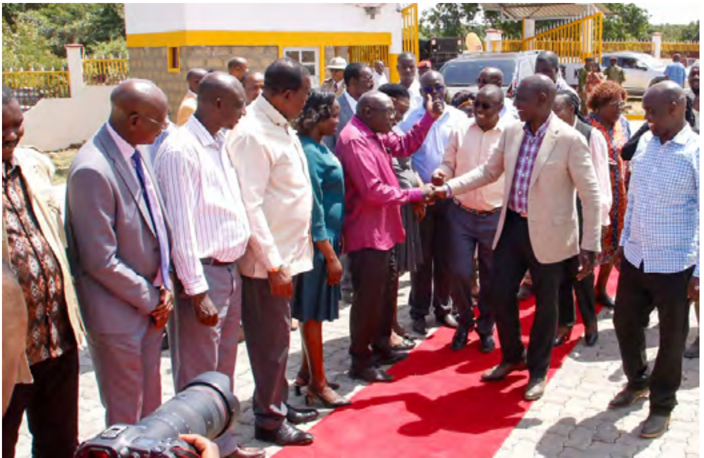
President William Ruto being received at Kerio Valley Campus.