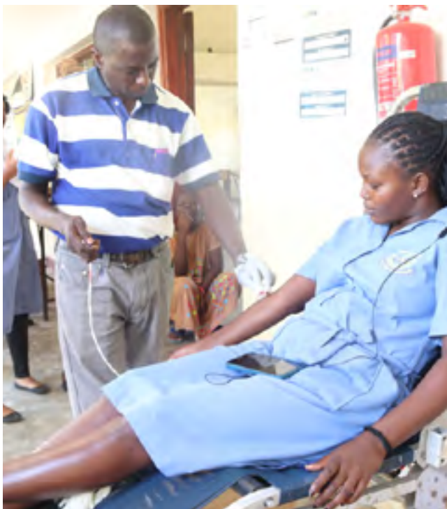
On January 17, 2025, Lamu Campus staff and students demonstrated their commitment to saving lives by participating in a blood donation drive.