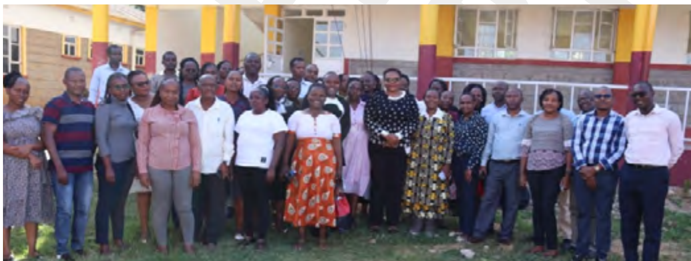
As part of the government's transition from a two-tier to a three-tier HIV testing algorithm, KMTC Mbooni hosted healthcare workers from various facilities in Mbooni Sub-County on January 21, 2025. The training aimed to equip them with updated knowledge and skills to enhance HIV testing and diagnosis.