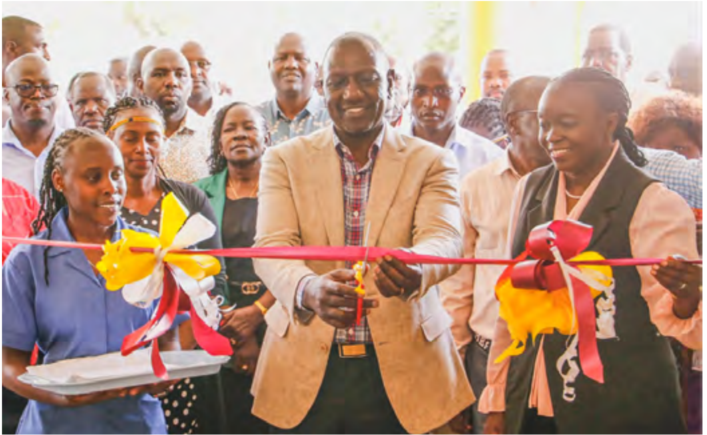
President William Ruto during the commissioning of Kerio Valley Campus.