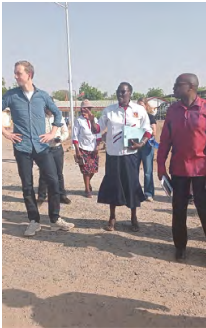
Lodwar Campus hosted the UNHCR team and donors on January 21, 2025. The team held discussions on the transformative student scholarship programme and key projects in the Campus.