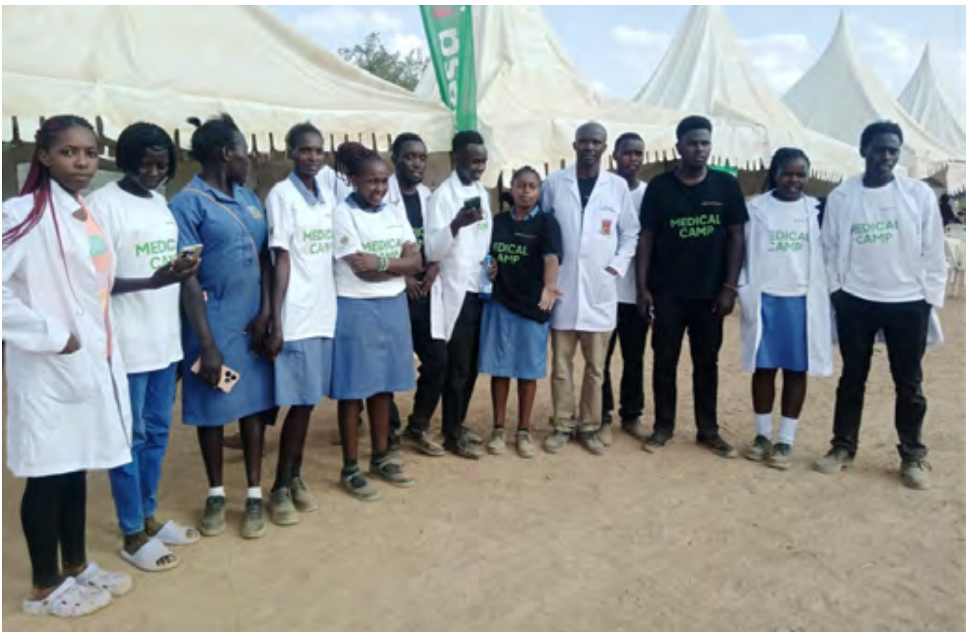
Chemolingot students and staff on January 26, 2025 participated in a free medical camp sponsored by Safaricom Mpesa foundation in conjunction with the health services department of Baringo county.