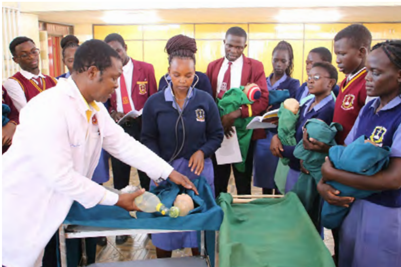
KMTTC Students and their lecturer during a clinical demonstration.

T he College through the Ministry has initiated discussions with the government to reinstate Higher Education Loans Board (HELB) funding for its students.