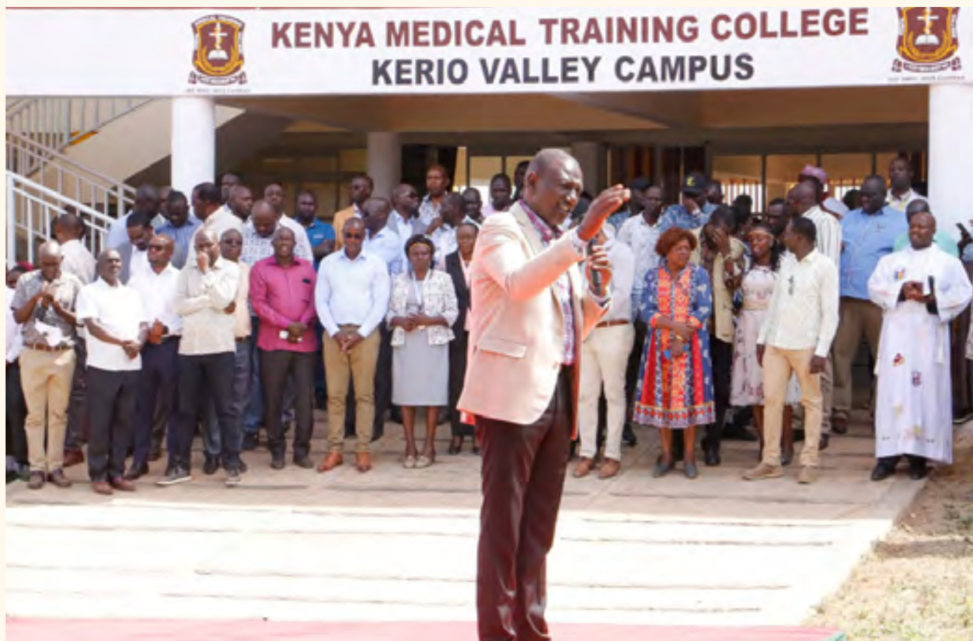
President Dr. William Ruto at Kerio Valley Campus.

T he College is set to receive Kshs 600 million from the National Treasury to recruit additional staff and strengthen health training in the country.