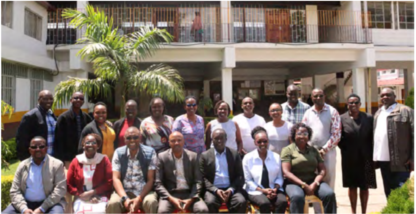
Participants during the workshop in Nakuru.

For many researchers, the journey from discovery to implementation is often hindered by one major challenge, the inability to translate research findings into effective policy briefs. Without clearer, concise, and actionable summaries, groundbreaking research risks gathering dust instead of shaping real-world solutions.